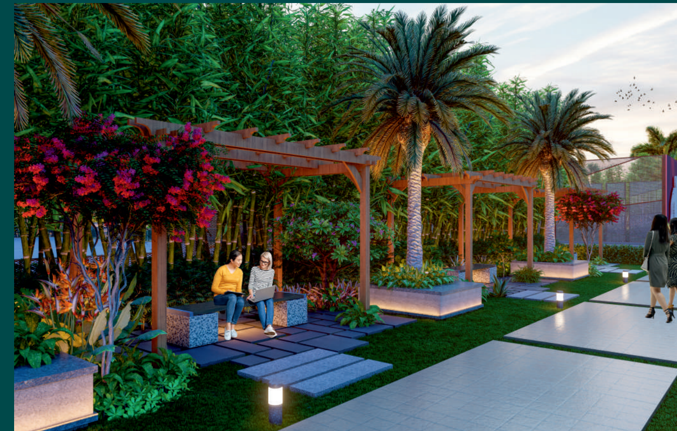
Cabanas & Beautiful Landscapes